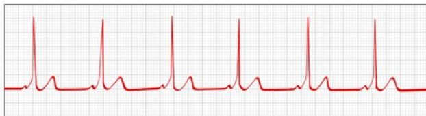
Wolff-Parkinson-White Syndrome (WPW)