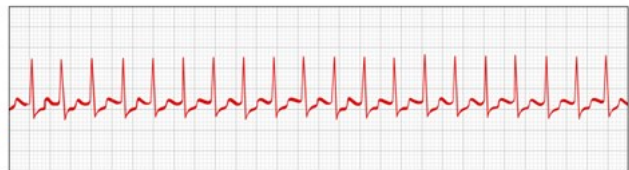
EKG – Supraventricular Tachycardia (SVT)